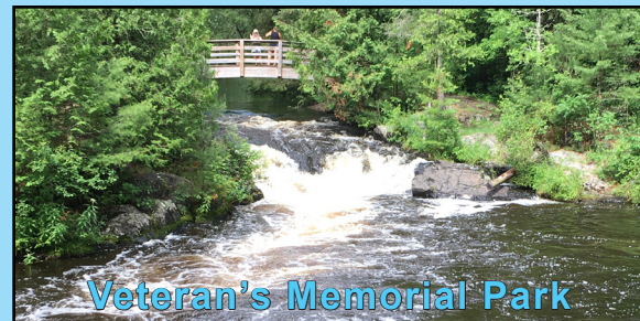
Veteran's Memorial Park

Located on the Thunder River, a class 1 trout stream, this park is both a day use park and a campground featuring 15 electric campsites, picturesque waterfall, wooden bridge, hiking, hand pump to access potable water, and some great trout fishing.