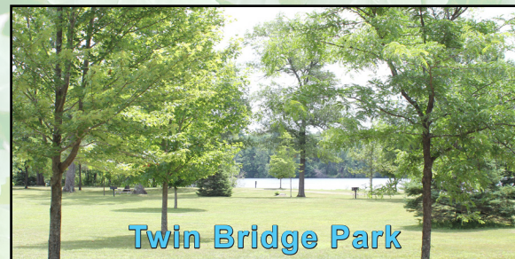
Twin Bridge Park

Located on High Falls Flowage on the scenic Peshtigo River, the park is both a day use park and a campground featuring 62 campsites, one group campsite, electrical hookups, shower house, sanitary dump station, swimming beach, dog beach, playground, and access to world class fishing. Camping is by reservation only.