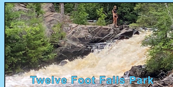
Twelve Foot Falls Park

Located on the scenic North Branch of the Pike River in the Town of Dunbar, the park is both a day use park and a campground featuring 12 campsites, two picturesque waterfalls, hiking, great trout fishing, vault toilets, and a hand pump to access potable water.